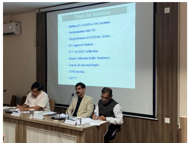
Issues for Immediate Attention