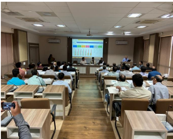
Opening remarks by Scientist, ESC