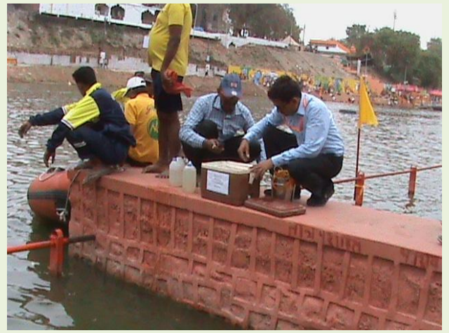
Manual sampling and analysis by MPPCB team for validation of online monitoring results

The real-time monitoring results helped the administration to take immediate measures like aeration, ozonation, addition of fresh waters etc to maintain the water quality. The Paddle wheel aerators, fountains and surface aerators were installed by UAD Deptt / local administration in the river bed.