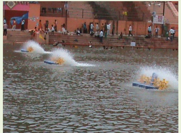
Fountains and paddle wheel aerators at Mangalnath Ghat for River water purification

In addition to aeration process, ozone generation plants at five locations were also installed by the local administration, generating ozone continuously by corona-discharge method, to treat the river water. About 600 gm/hr ozone dosing was practiced in the river water at each of the five locations.